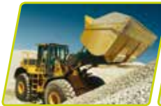
Wheel loader scales