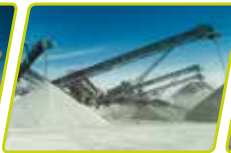
Fixed belt scales