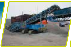
Mobile belt scales